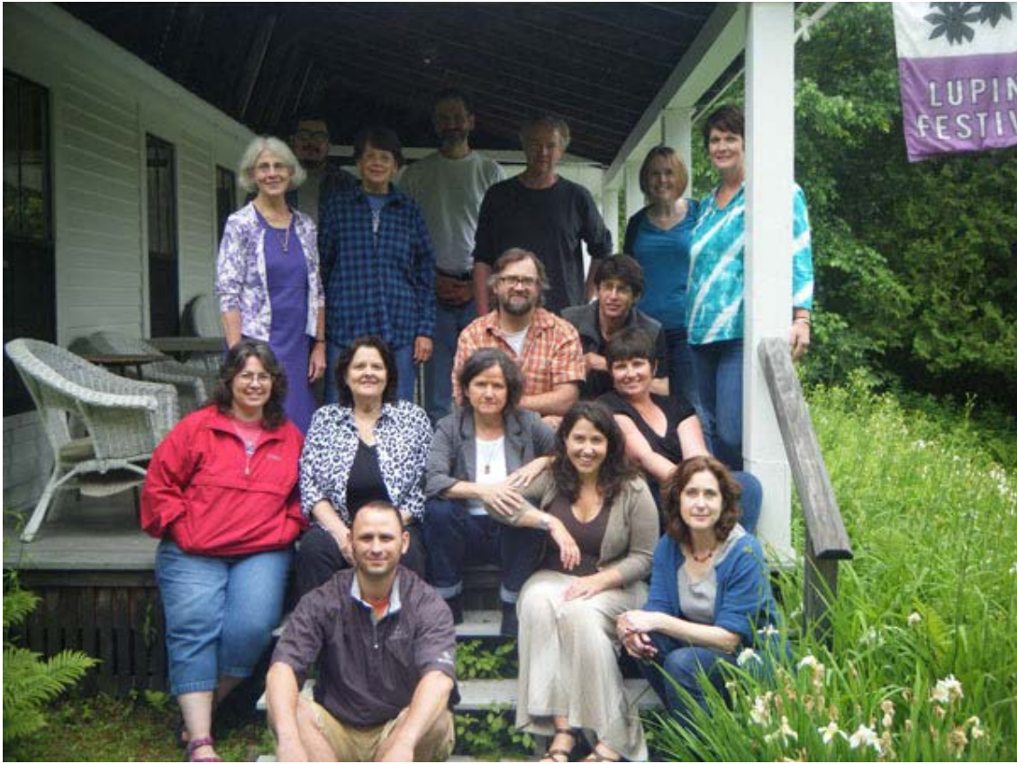
A group photo from the 2014 Conference on Poetry and Teaching. Join this wonderful group of poet-teachers.