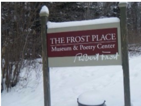
Thanks for a great season!

Once you select "Friends of the Frost Place," as long as you return to smile.amazon.com , The Frost Place will benefit. No change in prices, no change in your shopping!